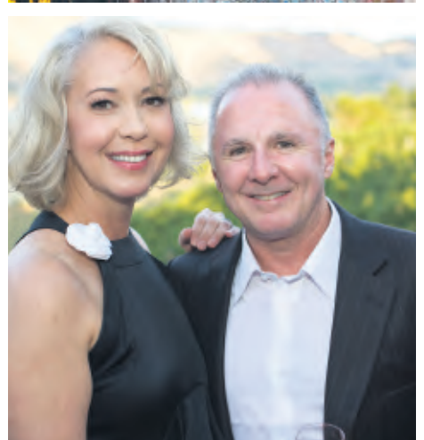
More than 220 guests from Vancouver's Lower Mainland and beyond attended an invitation-only celebration of food, wine and fine living in Osoyoos over the August 27-28 weekend hosted by boutique winery LaStella. The event drew attention to the South Okanagan region and LaStella's distinct spirit and approach to winemaking.

he brisk pace of harvest may have replaced the carefree days of summer in the South Okanagan, but in the charming wine-country town of Osoyoos, the memories of what many recall to be the event of 2010 still linger sweetly.